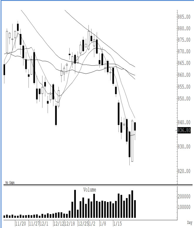
S50H24 (Close 836.80 Chg -3.90)